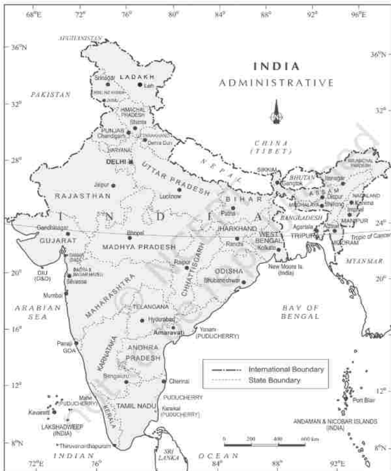
Figure 1.1 : India : Administrative Divisions